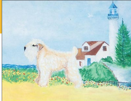
Beach Illustration by Syd

To learn about support groups, services, research centers, clinical trials, and publications about AD, contact the following: