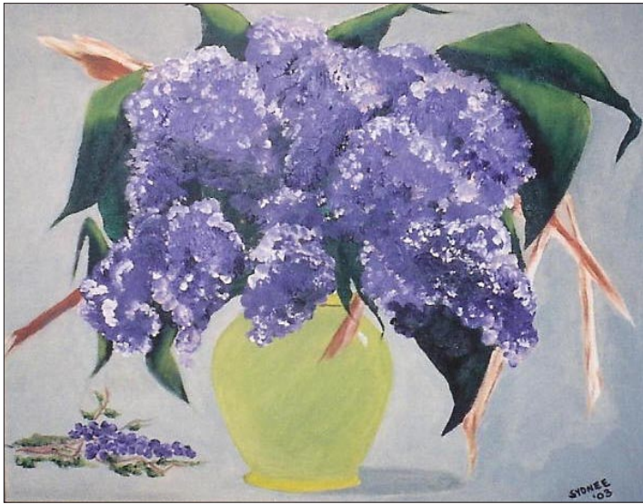
Flowers Illustration by Syd